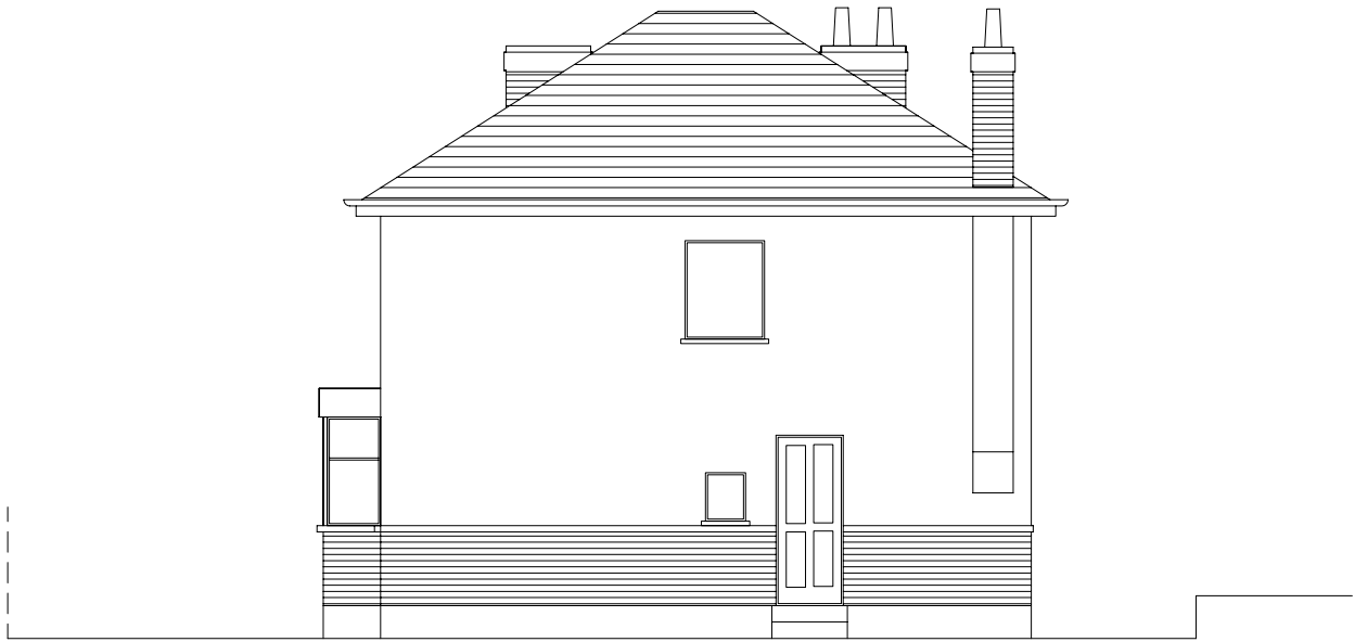
Existing Side Elevation (Right)